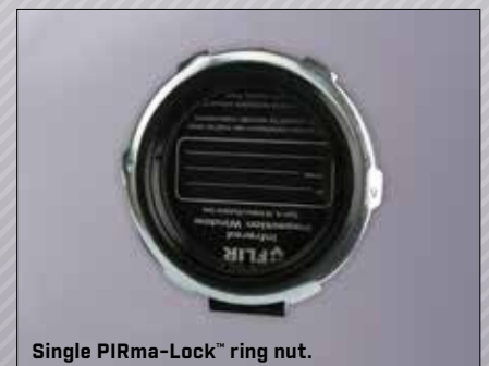
Single PIRma-Lock™ ring nut.