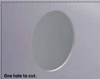
One hole to cut.