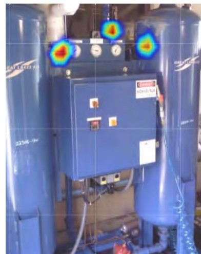
Figure 1. With portable acoustic imagers, technicians can quickly locate compressed air leaks simply by pointing the device at an asset or system or scanning a large area – from a safe distance, with the line still running, and no matter how noisy the plant.

The introduction of portable acoustic imaging for air-system condition monitoring was revolutionary and the solutions proved hugely successful. Suddenly, technicians could quickly locate leaks simply by pointing the device at an asset or system or scanning a large area – from a safe distance, with the line still running, and no matter how noisy the plant. Seeing the sound in context coming from hoses, fittings, or connections allowed them to quickly make corrections and considerably reduce costs (see Figure 1).