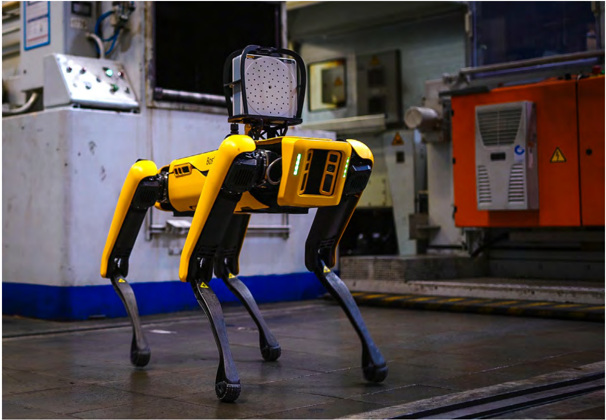
Figure 3. A new partnership with Boston Dynamics, announced in July 2021, couples its dog-like agile mobile robot Spot with the SV600 payload.

agile mobile robot Spot with the SV600 payload (see Figure 3).